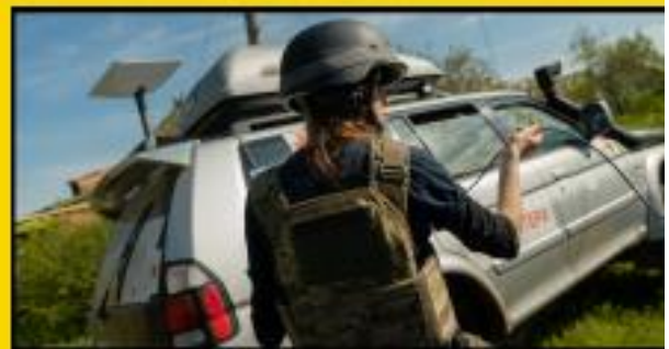
Base UA team setting up internet in a village in Donbas

Once the volunteer form is filled out, there will be a short onboarding process. If you're interested but are unable to volunteer at this time, please consider joining our monthly mailing list to stay informed about our organization. Please see the link to our general FAQ sheet here and disclosures and legal considerations here for additional information.