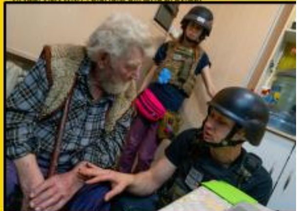
Base UA team working with a patient