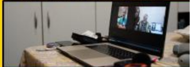
Virtual visit with TeleHelp Ukraine provider